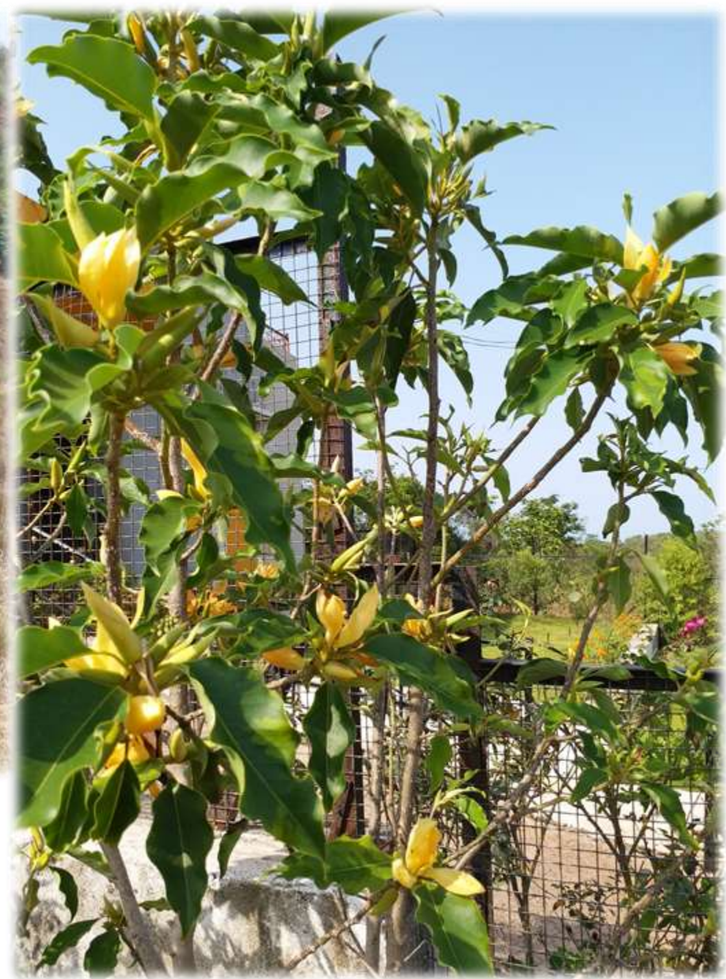
After Temple visit Dehan and Awashi plantation