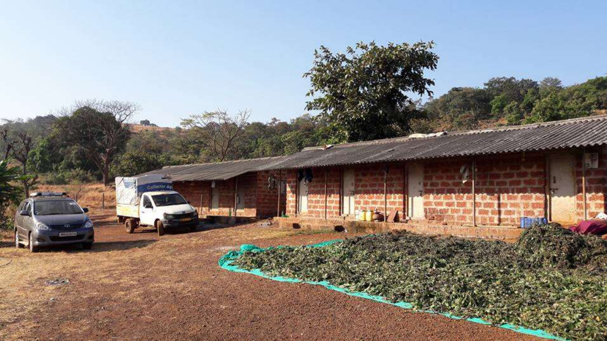
After Harne Beach going to DEHAN for known more about distillation process